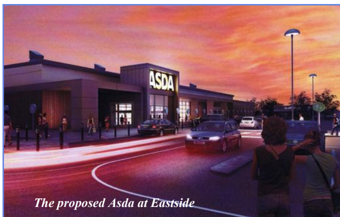
The proposed Asda at Eastside

The first application to be submitted is a proposal to build an Asda supermarket on land at Eastside between the existing buildings and recreation ground and the Ouse Estuary Nature Reserve. The Asda store would be at the southern end of the site, with houses built by Barratts at the northern end of the site. The proposal would include the construction of the first part of the port access road which has long been planned.