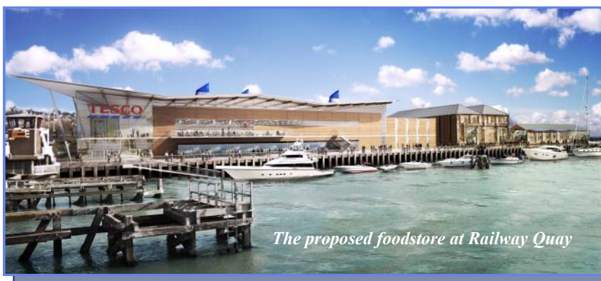
The proposed foodstore at Railway Quay

www.lewes.gov.uk/planning . Lewes District Council, who will be making the decision on these planning applications, welcomes opinions from the public—please send them to Planning Services, Southover House, Southover Road, Lewes, BN7 1AB, or email Planning@lewes.gov.uk