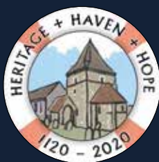
ST MICHAEL'S, NEWHAVEN

An on-water display just off Seaford Beach from 10.30am – 12 noon (subject to operational requirements). Come along to see the lifeboat in action! Live commentary will be provided for your enjoyment and appreciation of the work of the volunteer lifeboat crew. Free to watch, although all donations on the day will be appreciated.