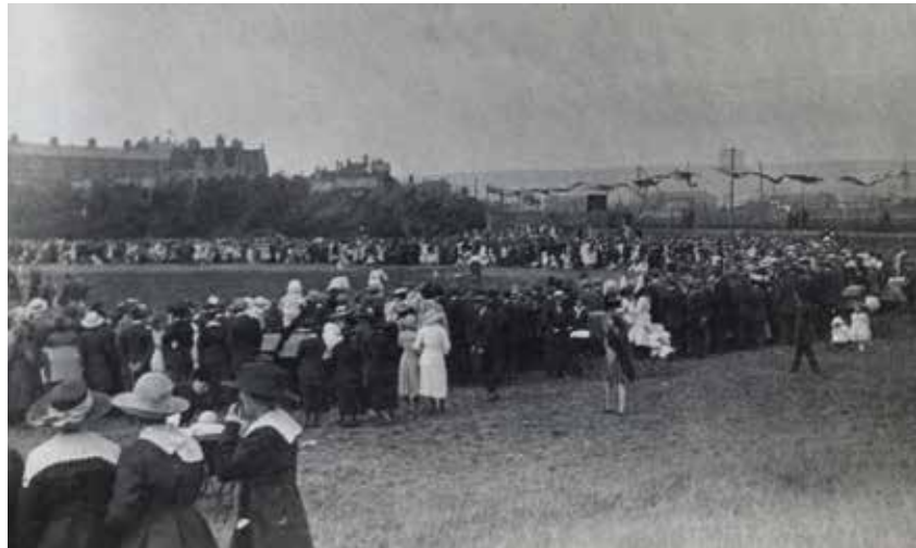
▲ Peace celebrations at Fort Road Recreation Ground 1919

In October 2018, Newhaven Town Council received a National Lottery Heritage Fund grant of £9,900 to deliver a project commemorating the centenary of Peace Day in Newhaven and Denton.