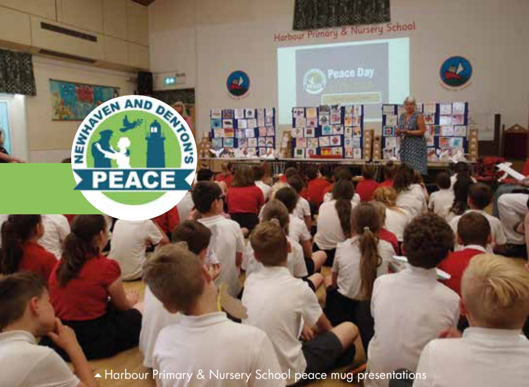
▲ Harbour Primary & Nursery School peace mug presentations