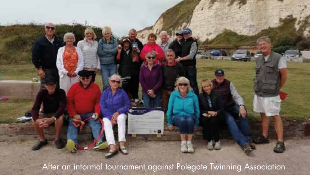
After an informal tournament against Polegate Twinning Association