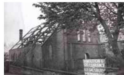
Christ Church demolition April 1969

Permission for the demolition had now been given by himself, the Parochial Church