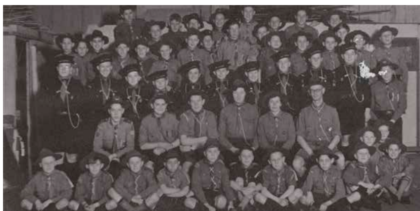
1948 - By G Christmas

Contact: 3rdNewhavenScoutGroup@outlook.com