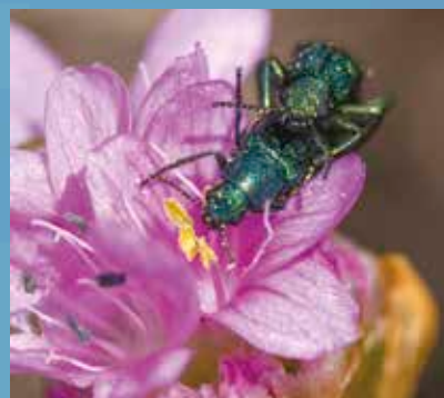
Psilothrix viridicoeruleus (soft-winged flower beetle)

The list also contains critical observations of nesting birds and shows how bird numbers swell during the season as migrating species arrive