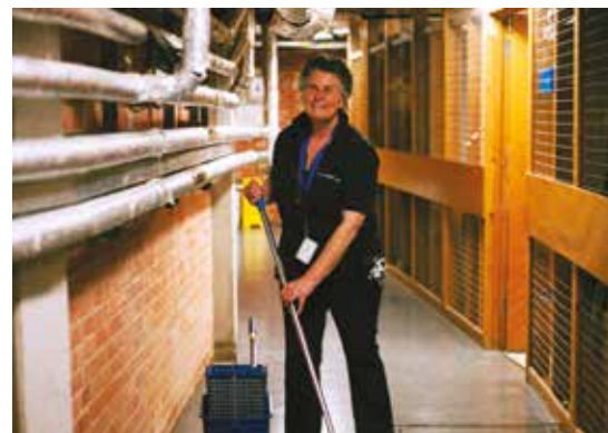
Quotidien bousculé #12, 2016, Pauline Le Pichon - taken during the artist's residency at Glyndebourne