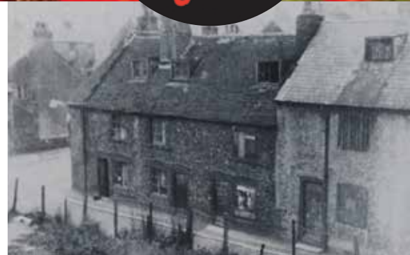
Essex Place