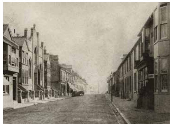
South Road

In addition to this, he assisted his mother, who ran the New Bridge Inn, and he also did munition work in his spare time. He was up at 5am and often didn't get to bed until 1am the following morning. During the hearing, he said that he would prefer being in the Army, as he would have much less to do than he did now. A conditional exemption was allowed.