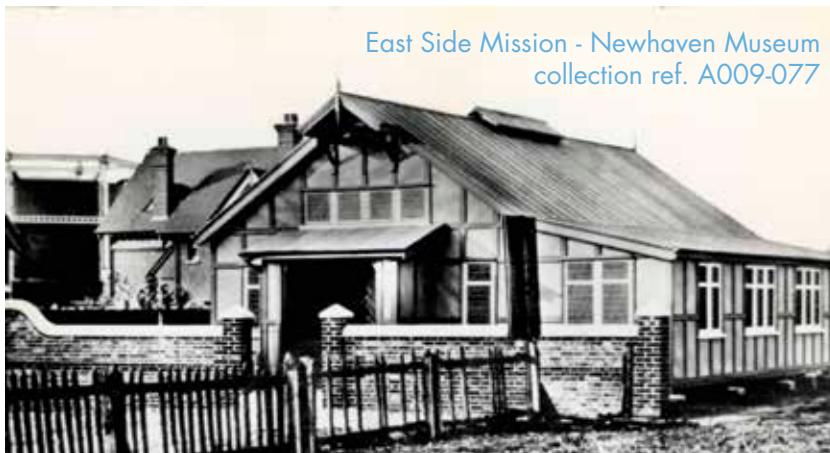
East Side Mission