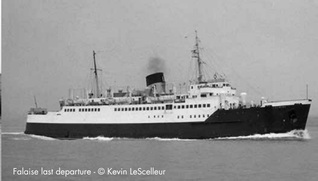
Falaise last departure