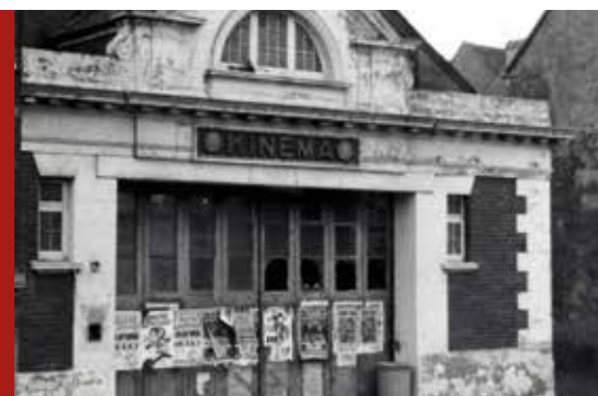
▲ A012-048 - The Kinema (later Fire Station), Meeching Road, in March 1977, shortly before its demolition.

During the interval, thanks were given to the Kinema staff for the use of the hall and for volunteering their time, and to the women of the Women's Army Auxiliary Corps, who sold tickets and programmes to the crowded audience.