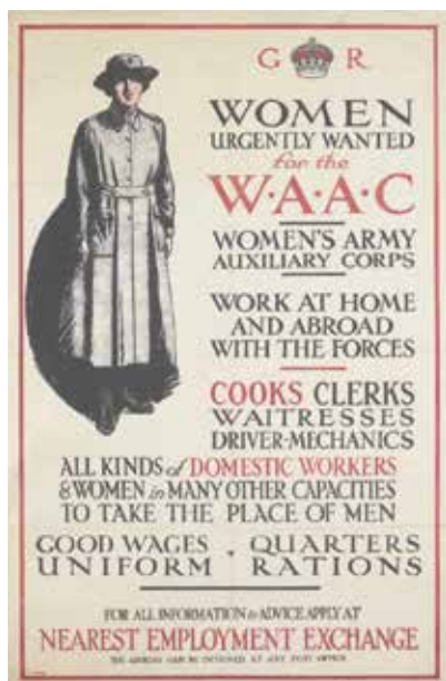
Poster from Imperial War Museum ©IWM (Art.IWM PST 13171) ▼

Private Ellen Packham was born in Newhaven and, before the war, worked as a housemaid at Wilmington Lodge in Keymer. Her family lived at 13 Sussex Place, Newhaven.