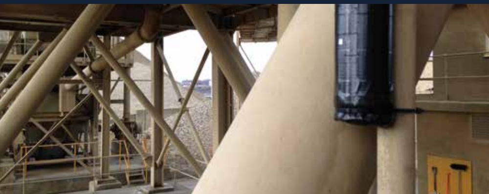
Pinhole solargraph camera, Shoreham cement works, Feb 2013

Further information about Diep~haven and this year's festival programme can be found at www.diephaven.org .