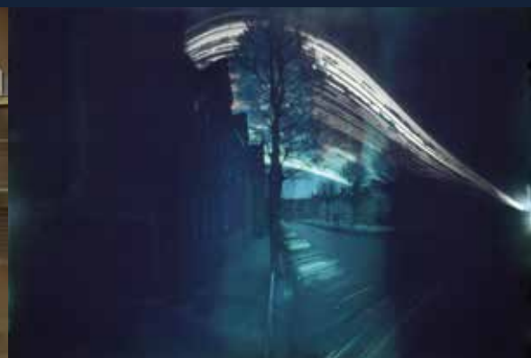
4-month-exposure pinhole photo, Connaught Road, Hove, Aug - Dec 2012