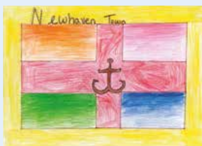
CATEGORY 2 YOUNG PEOPLE UP TO 18 YEARS