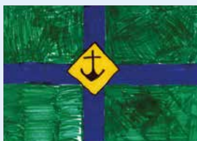
CATEGORY 1 CHILDREN AT PRIMARY SCHOOL

the contenders. You have all done Newhaven proud! Keep your eyes peeled for the flags which will be flown during the Newhaven Arts Festival at the end of August and carried in the procession for the Festival of Belonging on Bank Holiday Monday 27th August.