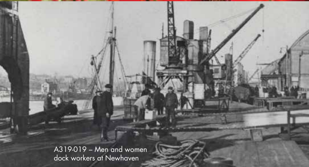
A319-019 – Men and women dock workers at Newhaven