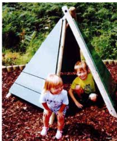
Play Wig Wam

The area of grass next to the Hillcrest Community Centre, which has been closed to the public for some time following problems with the air raid shelters beneath the area, is to receive a complete make over this summer.