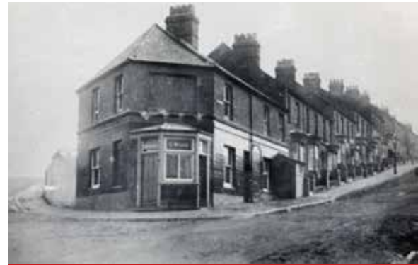
Photograph: Newhaven Museum A026-074

A special one off Dieppe Raid Medal was posthumously awarded to Sooty RN at the 50th Anniversary 1992 – RIP. LCT no.5 had sailed from Newhaven and the citation also notes that Sooty RN was the only female present in the entire force!