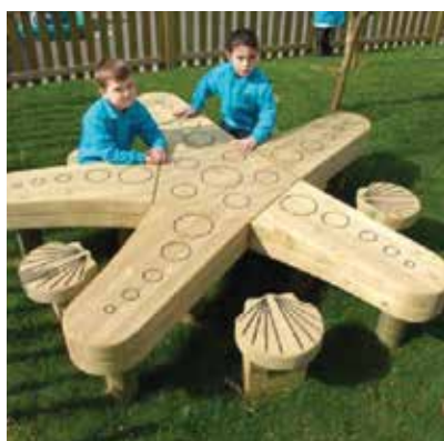
Starfish Table and Chairs