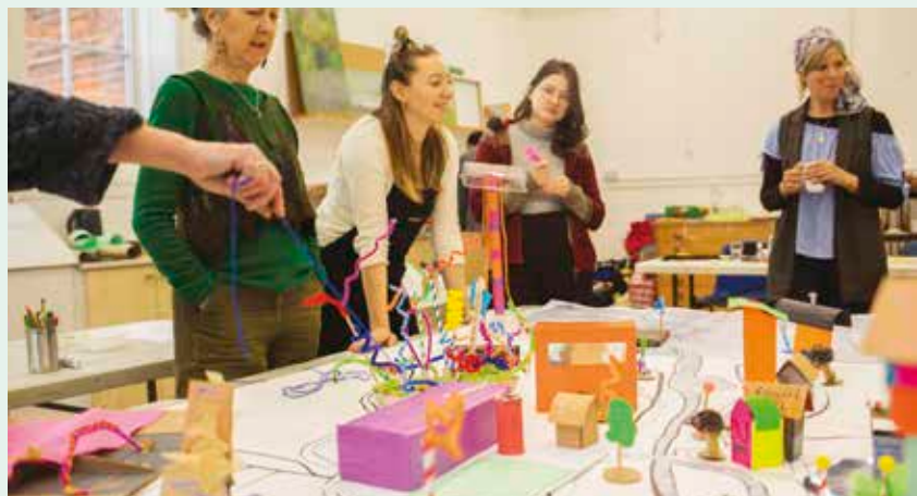
▲ Hospitable Environment

Community arts organisation Hospitable Environment uses food and creativity to connect with local people through projects like the woodfired bread oven, and Soup & Social - their free shared meal and community conversation. Their award underpins the delivery of more opportunities and events in Newhaven through 2023 and beyond.