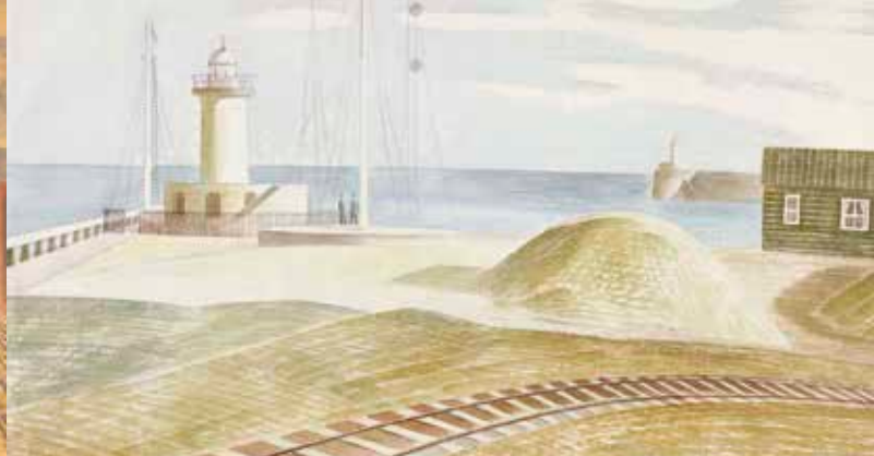
▲ Newhaven Harbour 1937