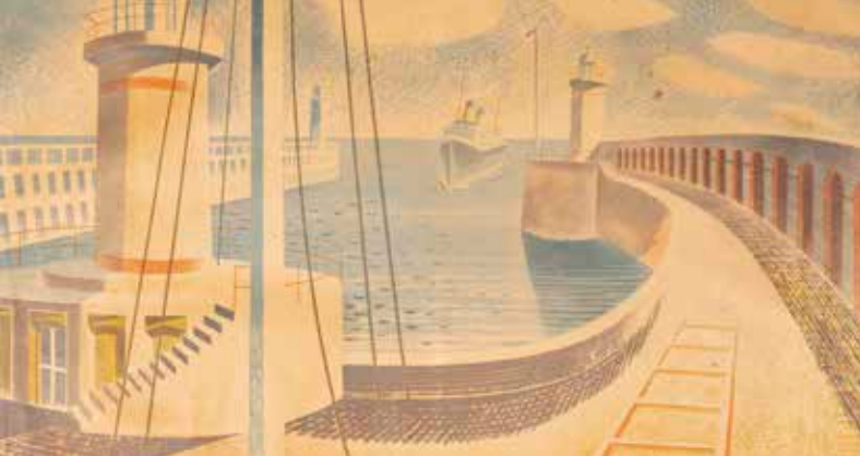
▲ Eric Ravilious Lighthouses at Newhaven 1935