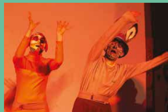
▲ Haven Young Creatives

We want to keep developing youth-led arts programmes, giving children and young people the opportunity to learn how to express themselves. They will build emotional resilience, confidence, and use their creative voices to be the best they can be. We want to change young people's perceptions of the arts and be proud to live in Newhaven.