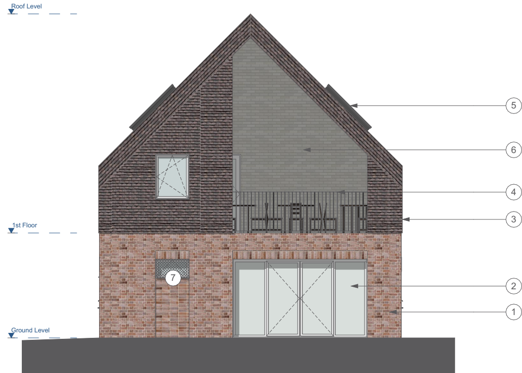
02 - PROPOSED SOUTH-EAST ELEVATION

KEY: Materials: 01. Red bricks to match existing 02. White window and door frames to match existing 03. Roof tiles 04. White metal balustrade 05. Anthracite coloured rooflights 06. White Bricks 07. Metal mesh, protecting smaller windows Outline Specification: -New windows to include concealed safety rolling shutters behind the facade for added security. -Roof to incorporate concealed gutters with internal rainwater downpipes for improved safety.