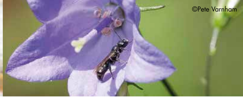
Two New Species for Castle Hill Local Nature Reserve in 2025

▲ Potter Spider Wasp - Auplopus carbonarius - A Nationally Scarce Species