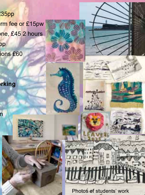
Photos of students' work